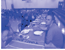
Faculty and student sit together in the Academy Thanksgiving tradition.

I attended UT-San Antonio, earning a B.A. in Sociology. I graduated from high school at age 17 and began college the following Fall. I was "young and impressionable" which might have made it easier for me to soak up the information. I lived at home the first two years, rented an apartment the last three years, and worked as a cashier at a grocery