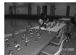
At the Thanksgiving Lunch, this table is decorated with edible decorations.

DON'T FORGET TO SEARCH FOR SCHOLARSHIPS AT FASTWEB.COM.