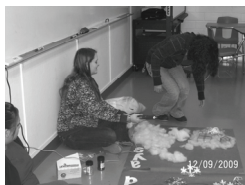
Student decorating their advisor's door in hopes of winning a hot chocolate party.

I believe that education is one of the most important factors needed to succeed in life. Having an education can bring you many things like advancement, a career, stability, and of course knowledge.