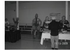
Faculty members serve the students at the Thanksgiving Lunch.