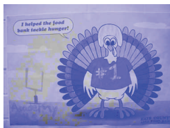
This turkey poster helped advisories keep track of their fundraising progress.

The first time I thought about college was during my Senior year when my counselor called me to her office and asked me what college I was going to. After 12 years of being told what school I had to go to, I was very surprised that college was a choice.